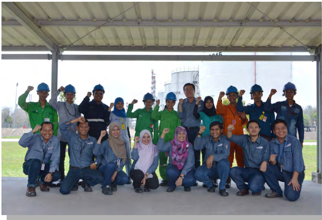
COO together with interns from SMK Taruna Persada and SMKN 3 Dumai