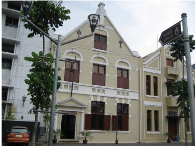
Wayang Museum Building Located in West Jakarta

Wayang Museum is located at Jl. Pintu Besar Utara No. 27, Jakarta. The building was a church established by VOC from Netherland in 1640. Until 1732, the building was used as praying venue by civilians and Dutch soldiers lived in Batavia (Jakarta).