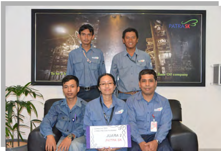
Patra SK awarded as Runner Up of Pre-Fire Planning Gernas K3 RU-II