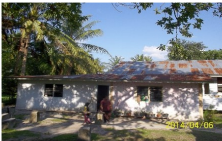
Dormitory before renovation