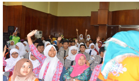
The student's enthusiasm for asking question

On 22 October 2014, Patra SK through its CSR programs for Education held drugs seminar for Middle and High School students in Dumai City. This event was attended by more than 500 students and teachers. This seminar was also attended by COO of PT. Patra SK, Dumai City Deputy Mayor, Chief of District prosecutor, Police head division of Drugs abuse, and Operational chief of BNK (National Drugs Abuse Control Department) as keynote speaker. During the drugs seminar, students showed very positive response and BNK reveals that 40 % of drugs abuse user are students. The reason why Patra SK supports BNK is to prevent and decrease rate of drugs abuse among the students by providing information regarding the danger of drugs abuse and also the consequences that might appear if they illegally use drugs (such as : will be dealing with Police and Prosecutor). They also reveal the effect of drugs to their physical and mental health. As closing BNK announces the winner of anti-drugs yel-yel (jingle).