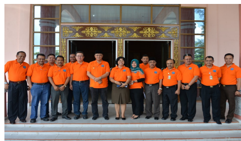
Dumai's Government officers and Patra SK Management.